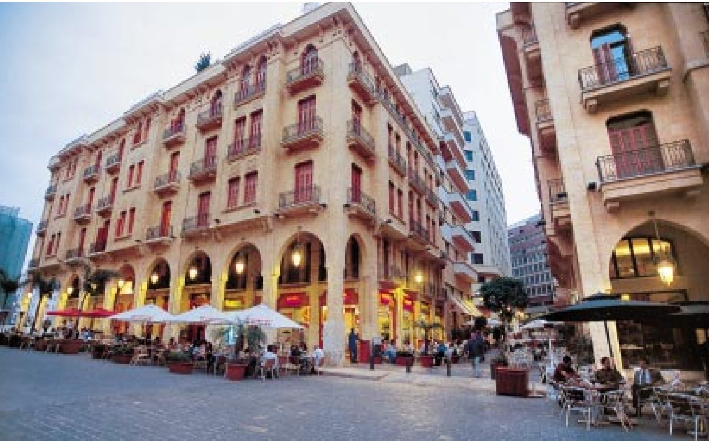
Restored by SOLIDERE, two adjacent Maarad street office buildings, with retail on street level: lot 201, with space offered for lease; lot 820, sold.