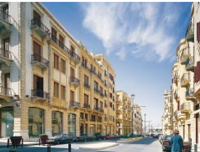
Below: Foch street.

The successful reemergence of Saifi as an urban village will serve as a model for the recovery of Wadi Abou Jamil.