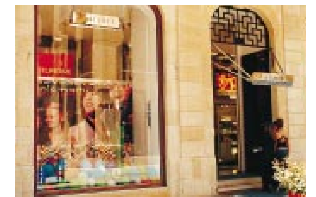
Above: restoration in Wadi Abou Jamil. Below: shop in restored Foch-Allenby building.

Of the retained built lots whose ownership devolved to SOLIDERE, 37 had been sold as is by the end of the year 2001, while one had been leased as is to be restored by its user. Their restoration is proceeding on the part of their buyers/user, with 21 ready and the rest under renovation.